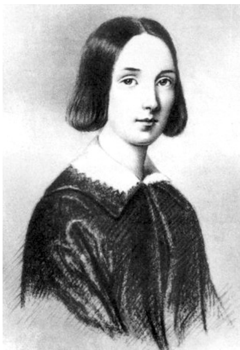
Unknown artist. A portrait of Natalia Aleksandrovna Herzen. 1844