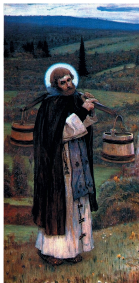
M. V. Nesterov. The Labours of Sergiy Radonezhsky. Left part of the triptych, 1896–1897