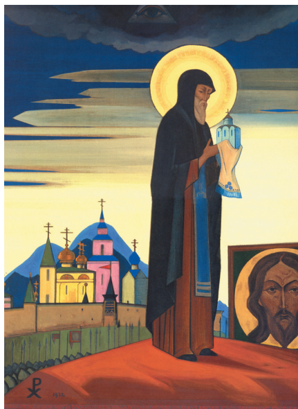
N. K. Roerich. St. Sergiy Radonezhsky, 1932