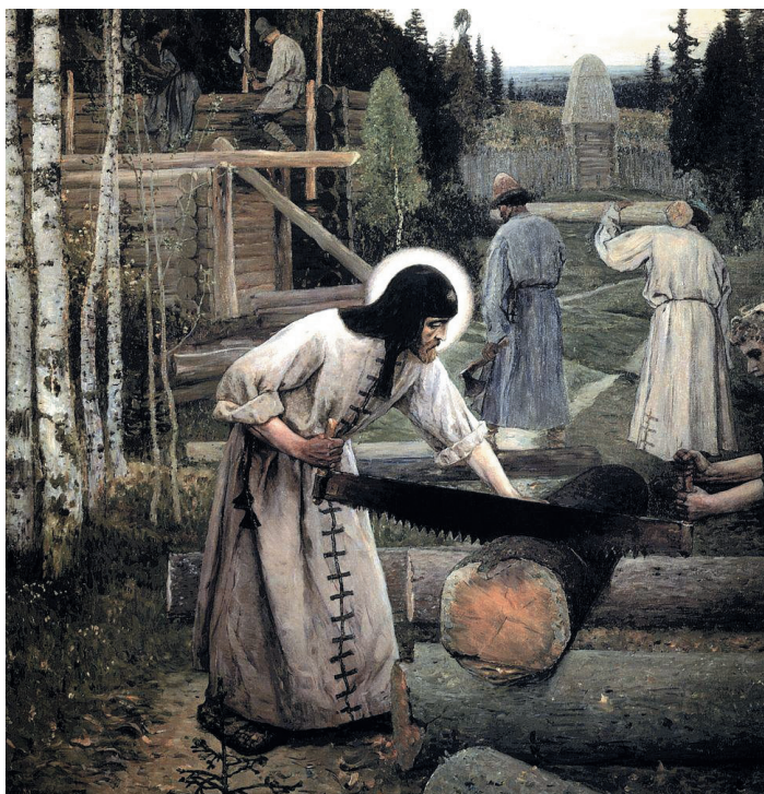
M. V. Nesterov. The Labours of Sergiy Radonezhsky. Central part of the triptych, 1896–1897