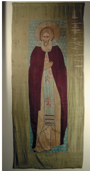
St. Sergiy Radonezhsky. Embroidered pall, 1 st half of the 15 th century